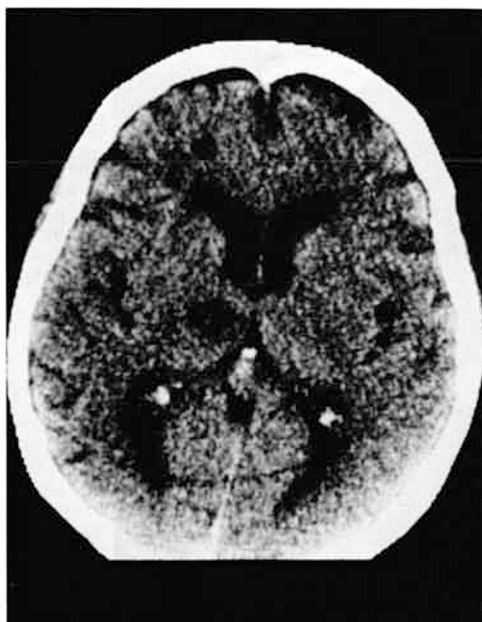
Fig. 3. CT scan of patient 3. Left medial thalamic infarct.