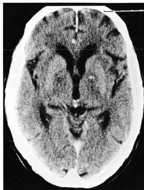
Fig. 4. CT scan of patient 4. Small hemorrhage in the left lentiform nucleus with surrounding edema.

his family what he had been doing that morning. He also looked several times in a closet for his tennis racket and wanted to call up a friend many times, to play a game, although he was told that his friend was at work. He did not complain of headaches or any other neurologic symptom. On admission 10 h later, the patient had recovered. He could not remember what he had been doing since breakfast time the same day, except the moment when his family took him to the hospital. On admission, neurologic and general examinations were normal. Standard neuropsychological testing done the day after admission was normal. A brain CT scan 36 h after the amnesic episode showed a hyperdense area in the left lentiform nucleus surrounded by a hypodense area, suggesting hemorrhage (fig. 4). An EEG was unremarkable. CT was checked 2 months later and showed no visible lesion. During the following year, the patient has had no recurrence and is in good health.