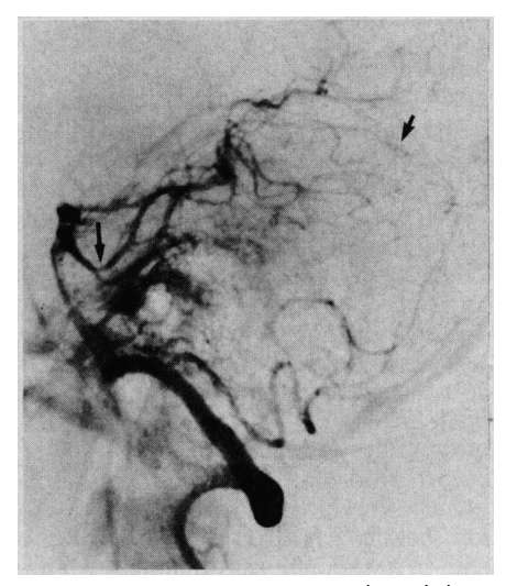
Fig 2.—Left vertebral angiogram, lateral view, with "beading" of distal small arteries (short arrow) and constriction of proximal segment of one superior cerebellar artery (long arrow).

level, and the protein level was 0.54~\mathrm{g/L} [54 mg/dL]).