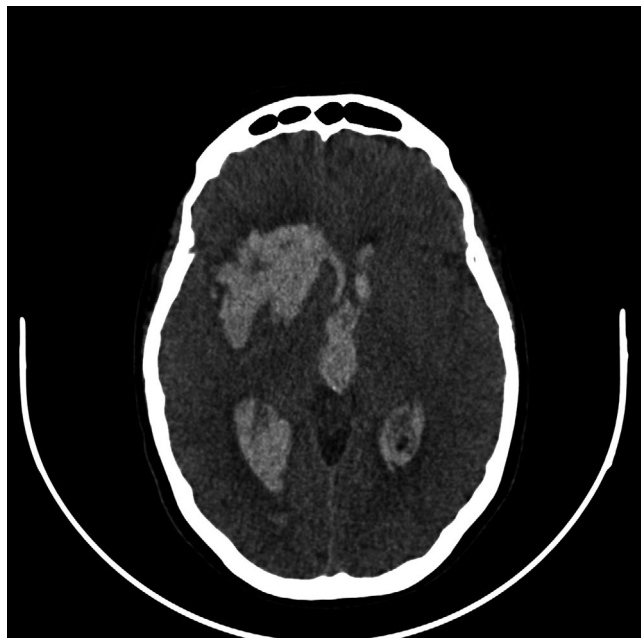
FIGURE 1 Computed tomography of brain (axial view) showing a large right deep frontal lobe parenchymal bleeding. Also note the midline shift and the black spot sign, suggesting a growing hematoma

of the vaccine. On day 5, she had a sudden onset of sweating and paleness, which has followed by left hemiparesis, vomiting, and somnolence. She came to the emergency room with a Glasgow Coma Scale of 7 and required orotracheal intubation; blood pressure was 160 × 90 mmHg. Computed tomography showed a large right deep frontal lobe parenchymal hematoma with the inundation of the entire ventricular system (Figures 1 and 2). Platelets count, fibrinogen, prothrombin time, and D-dimer were normal. Digital subtraction angiography did not show any signs of thrombosis or aneurysms in brain circulation. She underwent hematoma drainage and external ventricular drain, but intracranial pressure kept raising and she underwent decompressive craniectomy. We also did not find any signs of thrombosis in other sites. At the time of submitting this report (day 15), she is left hemiparetic, capable of obeying simple tasks, and on tracheostomy.