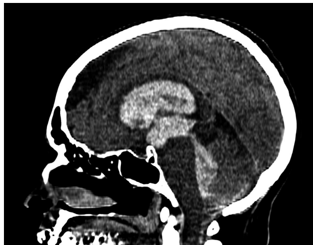
FIGURE 2 Computed tomography of brain (sagittal view) showing inundation of the entire ventricular system

Authors thank patient's family members for consent with this publication.