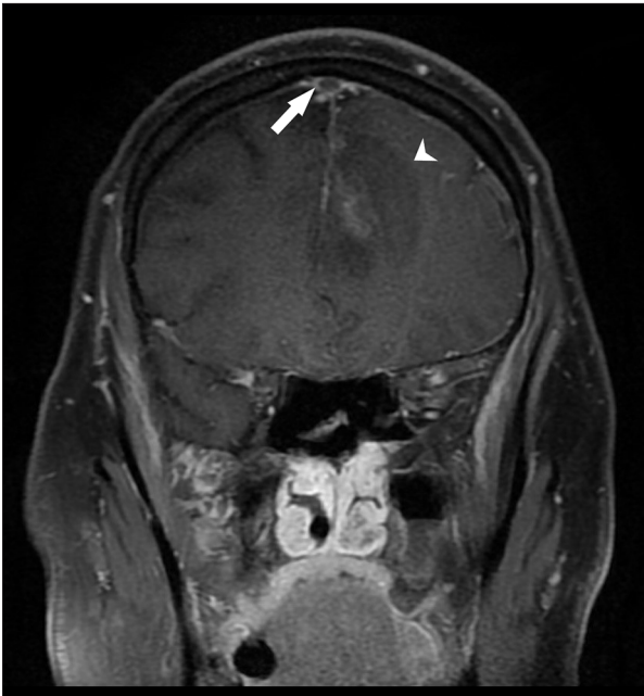
Figure 2. T1-weighted MRI coronal section showing filling defect in the superior sagittal sinus (arrow) with isointense signal of intracerebral hemorrhage (arrowhead) in the left frontal lobe.