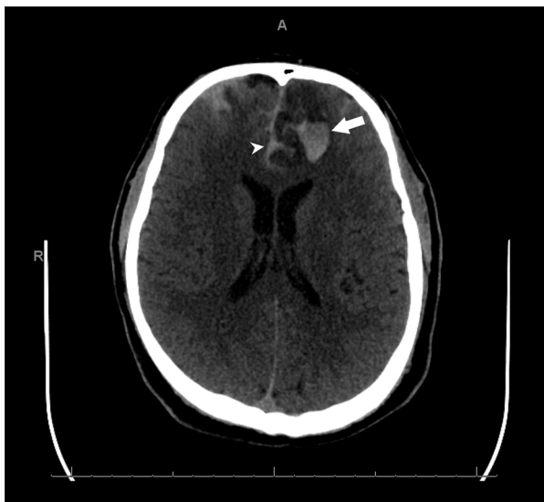
Figure 1. Non-contrast CT brain, axial section at the level of the lateral ventricles, showing intracerebral hemorrhage (arrow) and subarachnoid hemorrhage (arrowhead).

a goal INR of 2-3. He underwent a CT scan of the chest, abdomen, and pelvis, which ruled out any occult malignancies or other thrombosis. His echocardiogram showed a normal ejection fraction, no septal defects, and no intracardiac clots or valvular pathologies. A complete hypercoagulable panel ( Table 1 ) was within normal limits.