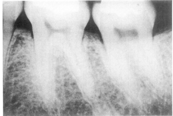
Fig. 2. Periapical radiograph of mandibular left molar region.

Panoramic and periapical radiographs of the involved region showed a condensation of bone, approximately 5 × 5 mm, inferior to the distal root of the mandibular left