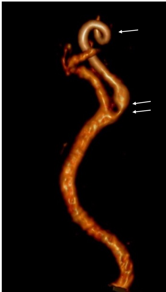
Fig. 2 Coiling in sub-petrous segment (single arrow).Supra bulbar stenosis and post-stenotic dilatation (double arrow)

injury [4]. In this regard, the mutation underlying HGPS renders the structure and function of the vascular wall defective [5]. The finding of arterial dissection has not been described to our knowledge. A vasculopathy unique to HGPS has been proposed as a cause of stroke since the hypothesis of atheromatosis has not been validated [6], as in our case. (Online resource 2 and 3).