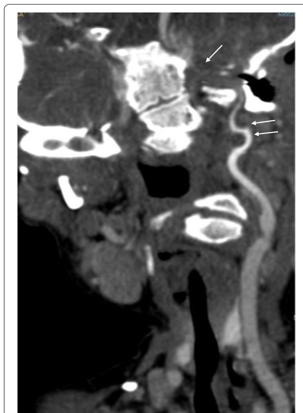
Fig. 1 Occlusion of the internal carotid artery in the petrous segment to the cavernous segment (single arrow) preceded by a long and progressive stenosis in the sub-petrous segment (double arrow)

The patient was admitted from the Emergency Department and conservative medical treatment with