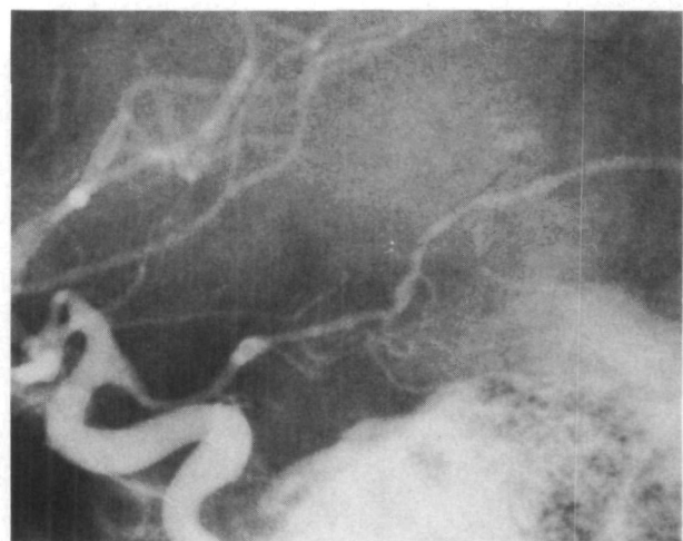
FIGURE 1. Case 23. Left carotid angiogram showing arterial constriction and dilatation in posterior cerebral artery.

A young man aged 25 had recurrent severe headaches for about 12 days before admission related mainly to doing calisthenics such as sit ups, push-ups, and skipping rope. The headaches, which lasted about one