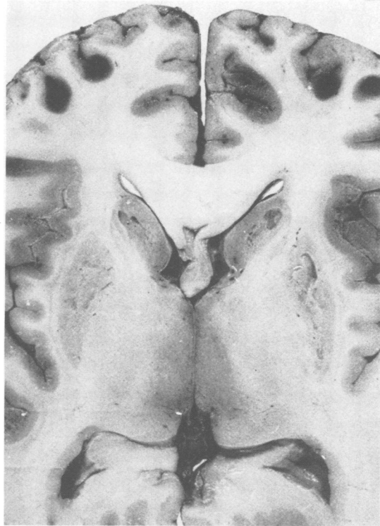
Fig 2 Transverse section of the encephalon at the level of the geniculate bodies. Parahippocampal herniation on the left side (right side of image), bilateral necrosis with cavitations of the head of the caudate nucleus and putamen and cortical haemorrhages can be seen.

sis. In the putamen, globus pallidus, and caudate nucleus, necrotic areas were seen (fig 3b), with numerous macrophages, astrocytic gliosis, spongiosis and capillary proliferation. Outside the necrotic areas, the neurons were relatively preserved. Similar changes, without necrosis, were present in the thalamus, hypothalamic nuclei, periaqueductal gray matter (fig 3c), substantia nigra, dorsal nucleus of the vagus and hypoglossal nucleus. The mammillary bodies showed severe spongiosis, vascular proliferation, shrunken neurons, some macrophages containing iron and preservation of the peripheral white matter (fig 3d). The cerebral white matter appeared moderately pale, with the nerve fibres undamaged. Haemorrhagic necrosis and vascular proliferation were present in some cerebellar folia. The cerebellar white matter and deep gray nuclei were normal. The spinal cord showed microhaemorrhages, vascular proliferation and spongiosis with preserved neurons, in the anterior and intermedio-lateral horns. The lateral and posterior columns were normal. Most of the optic nerve fibres were demyelinated. The sural nerve and the sympathetic ganglia were normal. In the skeletal muscle, there were signs of acute denervation of moderate intensity, with no mitochondrial abnormalities found in the electron microscope study.