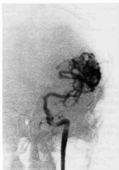
Fig. 2 Left internal carotid angiography. Due to a steal phenomenon the whole hemispheric circulation appears to be "concentrated" in the frontal AVM. Also the left ACA is not filled.

between the arachnoid membrane and a cortical vessel at the rupture site is critical for bleeding to occur directly into the subdural rather than the subarachnoid space (3, 5, 12, 17, 19). In our case we suggest that, given the existence of a locus minoris resistentiae created by a cortical-arachnoidal fusion somewhere in the area of the AVM, even a mild head injury resulting in minor motion of the brain caused tearing of the arachnoid membrane and triggered a progressive subdural bleeding (3).