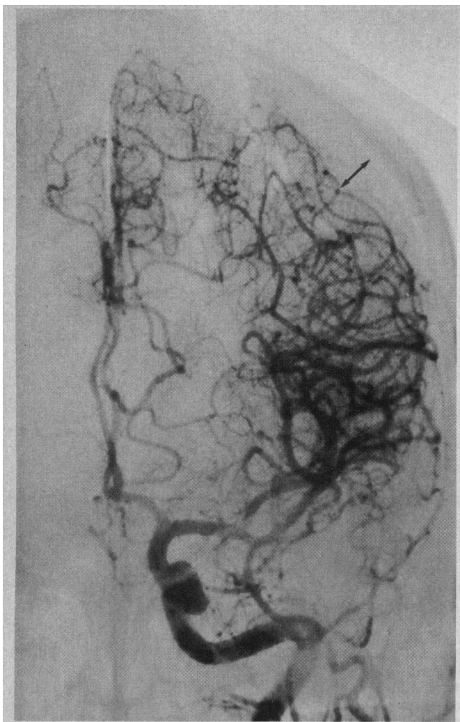
Fig 2.—Left carotid angiogram shows avascular extracerebral lesion (double arrow) with displacement of branches of middle cerebral artery branches away from inner table of skull.