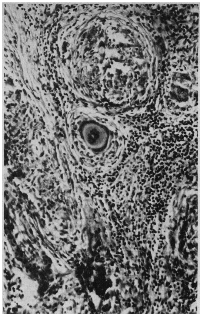
Fig 3.—Histologic specimen shows multiple granulomas with epithelioid cells and giant cells.

tive. Cultures for bacteria, acid-fast bacilli, and fungi were negative. A repeated myelogram showed only mild spondylosis at C5-6 bilaterally. A chest roentgenogram was normal. Angiotensin-converting enzyme was 133 units (normal, 40 to 125 units). A left parietal burr hole biopsy was performed; the specimen revealed non-caseating granulomas with an abundance of histiocytes and Langhans' and foreign-body giant cells (Fig 3). Special stains for bacteria, acid-fast bacilli, and fungi were negative.