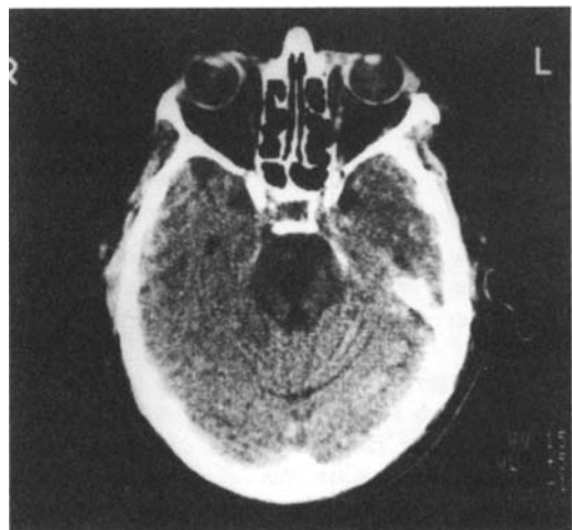
Fig. 2. CT scan of the patient showing a large infarction of the medio-ventral part of the pons.

Studies of evoked potentials have been rarely reported in patients with LIS and ocular bobbing. Different findings of BAEP's have been described in patients with LIS; these can be normal or show abnormalities of wave IV and V (8). Our patient had normal peak latencies of wave I and II but the other wave forms could not be elicited, indicating that the brainstem damage extended beyond the pontine base and included the