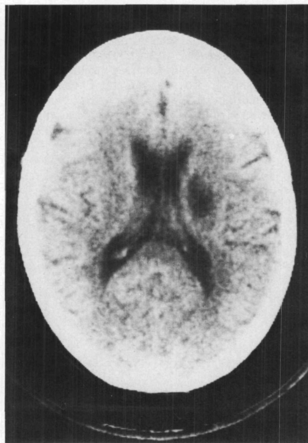
FIGURE 2. Case 1. CT scan on day 8 demonstrating lacune in the corona radiata.

such that by discharge at day 12 she could still not oppose the thumb to the fingers but strength was otherwise normal.