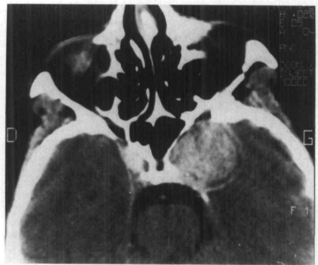
FIGURE 2. CT with contrast medium. Large thrombosed intracavernous aneurysm. Target image. Erosion of the anterior clinoid process and lateral wall of the ethmoidal sinus. G: left.

The aneurysm in this patient had a diameter of 2, 3 cms thus falling short of the definition of giant aneurysms (diameter higher than 2.5 cms). 4 To our knowledge only 1 similar case of occlusion of the ICA has been reported (Whittle et al. 5 ) As in our patient the proximal edge of the thrombus occluding the ICA was well beyond the ICA origin, suggesting retrograde thrombosis. Whittle et al in the same year reported a series of 12 patients with thrombosis of giant intracranial aneurysms (2 mentioned as 'carotid cavernous'). 6 It is not clear whether their case 4 is the same as that mentioned above. Nevertheless, in the reported cases, thrombosis of giant ICICA aneurysms resulted in ophthalmoplegia with proptosis and in one patient, facial dysesthesiae. In none of them was ipsilateral ophthalmoplegia with contralateral hemiplegia seen as in the patient reported here.