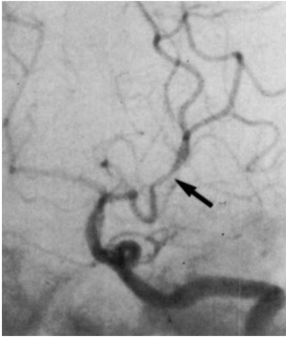
Fig 2. Anteroposterior view of a left subclavian angiogram. Moderate stenosis is identified at the junction of the peduncular and ambient segments of the posterior cerebral artery (arrow).

He had a history of hypertension, mild renal insufficiency, and peripheral vascular disease.