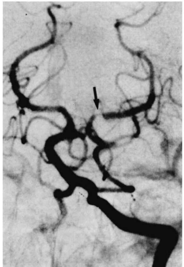
Fig 1. Anteroposterior view of a selective left vertebral angiogram with simultaneous compression of the left carotid artery. There is a high-grade stenosis (arrow) in the proximal left posterior cerebral artery just distal to its junction with the left posterior communicating artery. Compression of left carotid artery eliminated the possibility of flow artifact created by non-opacified blood from the anterior circulation.

A 68-year-old man had two TIAs over a 2-month period. While giving a sermon, he felt weak and lost vision to the right side as if something had blackened it out. His right arm became clumsy, with involuntary movements, and his speech was garbled. The attack lasted 2 to 3 hours. On another occasion he had weakness of his right hand. Neurological findings were normal. Bilateral carotid and left vertebral artery angiography demonstrated severe stenosis of the proxi-