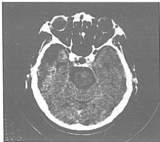
Fig. 3. X-ray CT scan. Area of low density in left temporal lobe.

The sequential scintigraphic images following intravenous injection of the tracer (cerebral angioscintigraphy) enhance the information provided by nuclear medicine techniques, and in some cases help in the diagnosis of vascular brain lesions with hyperperfusion (5,6). Nevertheless, this method does not provide a correct localization of the hyperperfused cere-