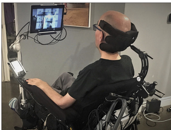
Figure 2. An example of advanced eye tracking technology for patient communication and mobility. The keyboard is controlled by eye movement, which is usually preserved in patients with LIS, and can be used for communication or control of other devices such as a wheelchair.