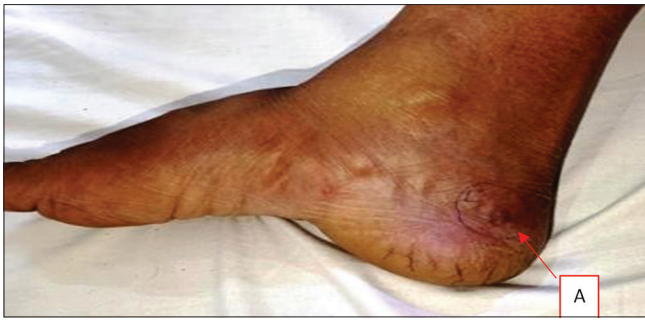
Figure 1: Viper bite mark at medial surface of foot