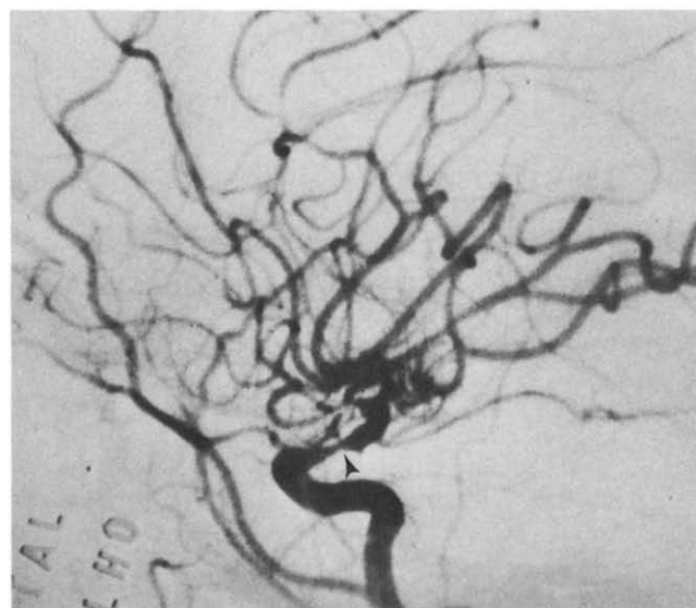
Figure 1. Angiogram of the left internal carotid artery, anteroposterior view (A), lateral view (B). Vasospasm of the supraclinoid portion of the internal carotid artery and of the proximal segments of the anterior and middle cerebral arteries is clearly shown.