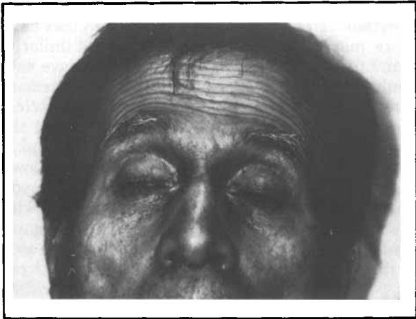
Figure 2. Intermittent inability to raise eyelids is induced in this patient after looking upward.

Patient 4. This man, at age 60, noted onset of gait difficulties and slowing of movements. A year later, he became impotent, and his blood pressure was low. Because of urinary incontinence, a suprapubic catheter was used. His gait gradually deteriorated, and he began having syncopal episodes; orthostatic hypotension was documented. At age 67, he was confined to bed and chair. Medications included carbidopa-levodopa and benzotropine mesylate.