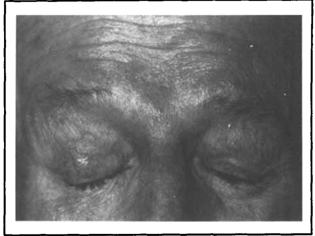
Figure 3. Prominent frontalis contraction will not open eyes of this patient with transient bilateral levator inhibition and blepharochalasis OS.

Examination revealed a severely impaired gait and retropulsion. Succession movements were slowed, and there was only minimal tremor of the hands. Tendon reflexes were normal. The optic disks were normal. Voluntary upward gaze was reduced, and upward excursion increased with oculocephalic testing. Fixation, pursuit movements, and saccades were normal. Mild blepharochalasis was present on the left. The patient was intermittently unable to raise his eyelids despite contraction of the frontalis (figure 3). Convergence was poor, and the glabellar reflex was persistent. There was abnormal suppression of the vestibulo-ocular reflex. CT showed mild