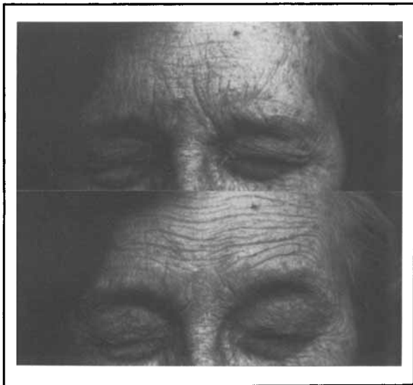
Figure 4. Top frame: bilateral involuntary orbicularis contraction is succeeded by (bottom frame) persistent orbicularis contraction OD and inability to open OS despite relaxation of orbicularis and frontalis contraction on the left.

levodopa or anticholinergic medication. One patient had Parkinson's disease; three had atypical parkinsonism (probably representing multiple system atrophy); one had progressive supranuclear palsy, and one had Shy-Drager syndrome. Goldstein and Cogan's four patients also had evidence of extrapyramidal disease. 3 Although only one of their patients had supranuclear limitation of eye movements, three of our six patients had supranuclear vertical gaze palsies. At the onset of ocular symptoms, our patients' mean age was 64 years, and the mean duration of extrapyramidal symptoms was 9.7 years.