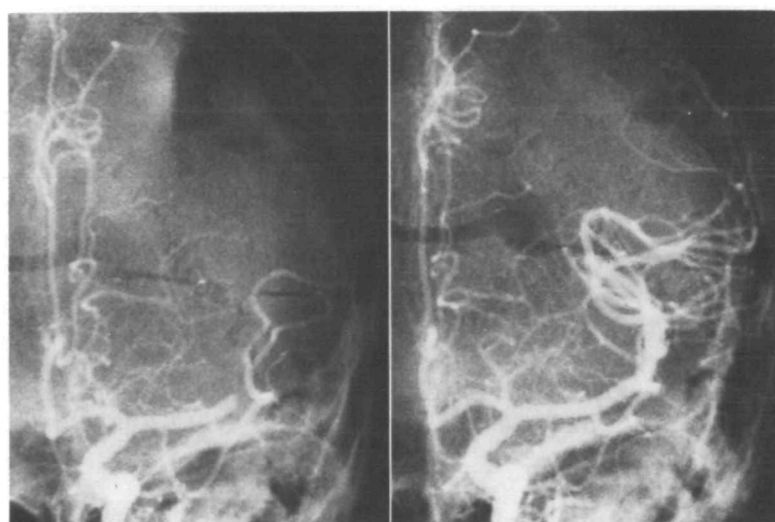
FIGURE 2. Case 2. Left carotid angiograms, anteroposterior views. Left: Initial appearance showing occlusion of the main stem of the middle cerebral artery. Right: Repeat study, 25 minutes later, showing normal appearance.

the middle cerebral artery (fig. 2, right). The patient was discharged without any neurological deficit.