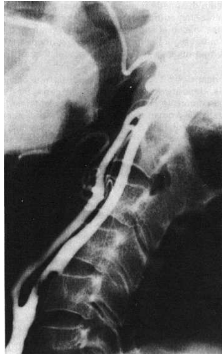
FIGURE 1: Case 1. Left common carotid angiogram preoperatively reveals left carotid stenosis. Plateau elevation of plaque can be seen. This was later found to be due to haemorrhage beneath the plaque.

In February of 1978, she developed sudden onset of weakness in the right leg and arm with complete expressive aphasia. There were no sensory symptoms and there was no history of amaurosis fugax. Over the next two days she regained almost complete power in the right hand and leg, but was unable to speak until the third day when her husband noted a marked stutter.