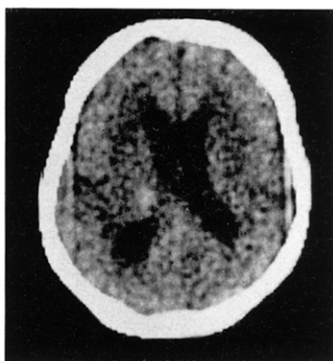
Fig. 3 — Case 3. CT scan picture showing left thalamic hemorrhage 17 days post-onset.

On admission, she was alert but disoriented for time and space. Speech was fluent with several paraphasias and comprehension was impaired. She had right spastic hemiparesis with increased deep tendon reflexes and a positive Babinski sign, reduced response to pin prick on the right side of the body and right homonymous hemianopia.