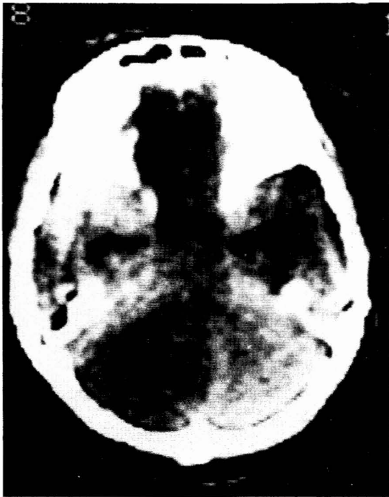
FIG. 1. Case 1. CT scan showing a massive left cerebellar infarction. Comparison between the right and left cerebellar hemispheres shows a large, low density area in the left cerebellar hemisphere.

of the arch of C-2. The infarcted tissue was resected. Histological examination confirmed the diagnosis of cerebellar infarction.