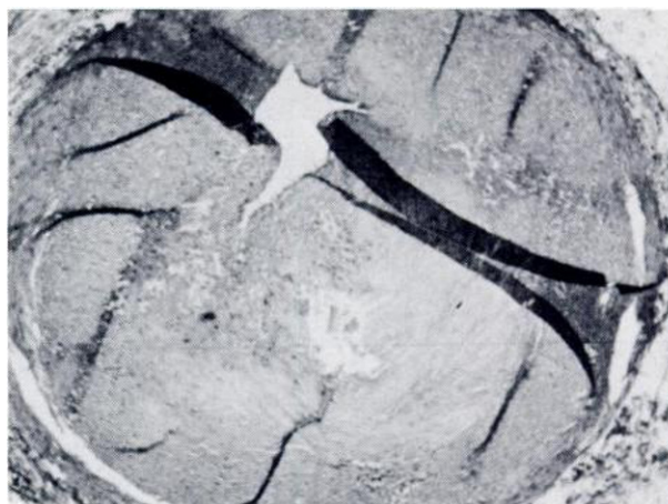
FIGURE 1. Photomicrograph of coronary artery of the patient's father ( \times 2.5 ). Severe, occlusive, intimal disease virtually obstructs the lumen. The lesion is mainly fibrous with some atheromatous material and smooth muscle cells.

Blood counts, urinalysis, serum electrolytes, spinal fluid, electroencephalogram, chromosome analysis, and serum proteins as well as electrophoretic pattern were all normal. LE cells were absent. Serum enzyme levels were SGOT 30 units, SGPT 60 units, SLDH 1,414 units, serum creatine phospho-