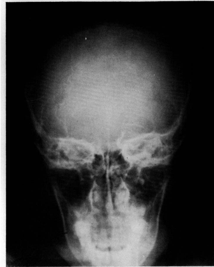
FIG. 3. Antero-Posterior View of left Carotid Angiogram demonstrating supra-clinoid occlusion.

On the eight hospital day he was out of bed and playing ball on the ward, and with no focal deficit except for residual seventh nerve palsy. He was being followed conjointly by a Physical Medicine and Rehabilitation team. He was discharged on anti-convulsants the next day.