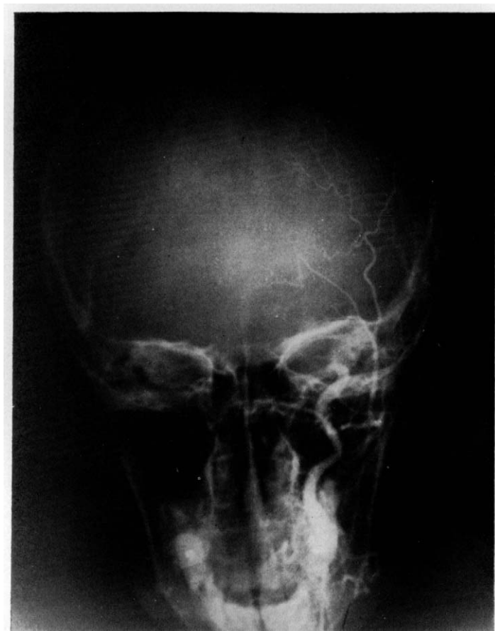
FIG. 1. Antero-Posterior View of left carotid angiogram demonstrating filling of the external carotid.