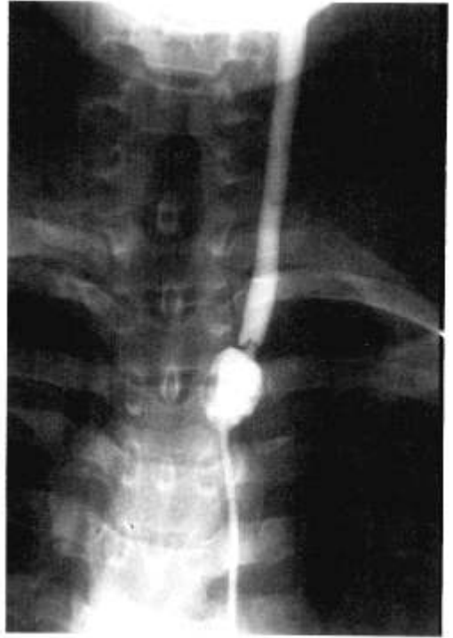
FIG. 2. Selective arteriogram of the left common carotid artery demonstrating the false aneurysm and the prolapsing torn distal edge of the vessel wall.

Traumatic tear of the thoracic aorta and its major branches is associated with such a high acute mortality that the majority of the patients with this injury fail to reach the emergency room with hope of survival (6). The