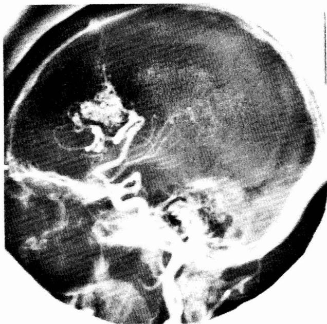
FIG. 1. Lateral projection, left carotid arteriogram demonstrating a posterior frontal arteriovenous malformation, January, 1977.