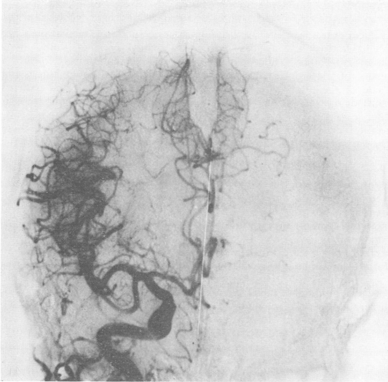
Fig. 1 Subtracted antero-posterior view of right carotid angiogram showing separation of right pericallosal arterial branches and supramarginal arteries from the midline by an avascular mass lying against the falx (case 1).