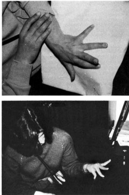
Fig 2.—A. Ulnar deviation of the wrist and athetosis of the fingers. B. Severe impairment of left arm coordination due to tremor and dystonia.

examination showed left arm dystonia of distal distribution (figure 2, A and B) and a coarse action tremor involving proximal arm muscles. A slight internal rotation of the left foot on walking was also observed. A new CT showed a small area of low density in the postero-lateral thalamic nuclei (figure, I-B). A right carotid and vertebral angiography was normal. Platelet aggregation tests and coagulation studies were normal.