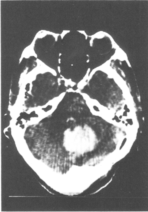
Fig. 1. Case 1 : CT scan on admission. Large vermian and right hemispheric haemorrhage in the cerebellum

normal, except a moderate distal tactile hypaesthesia in the inferior limbs. Blood pressure was 190/110 mmHg, pulsations were 100 min and regular, general examination was normal.