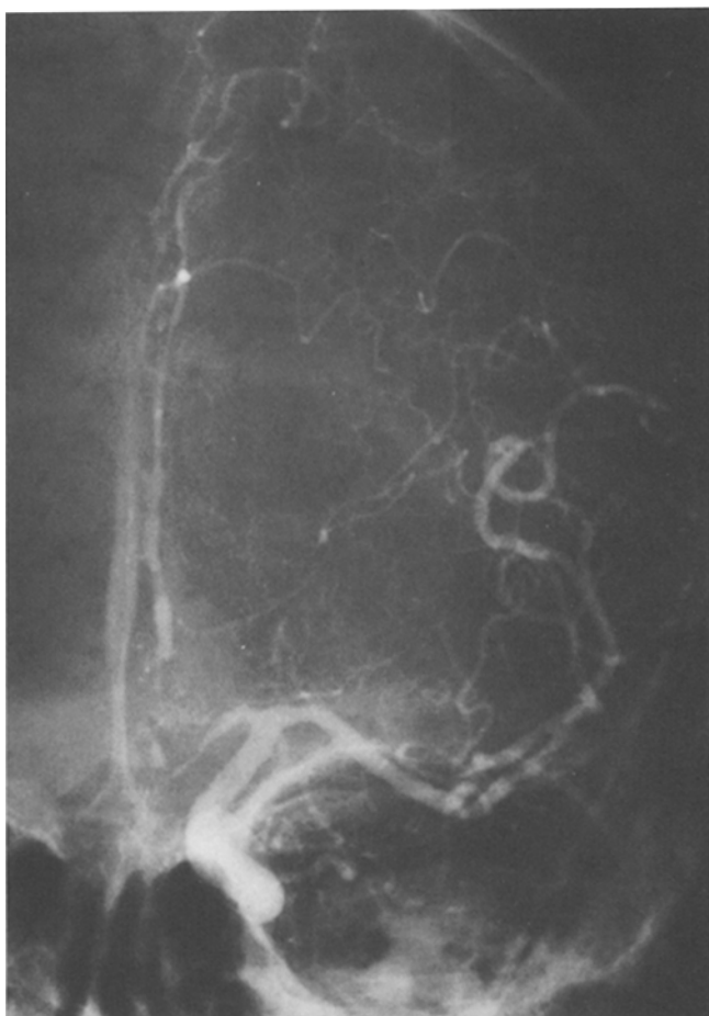
Fig. 1. Left carotid angiography (AP view) shows a marked segmental narrowing of the anterior and middle cerebral arteries with partial visualization of lenticulo-striate arteries