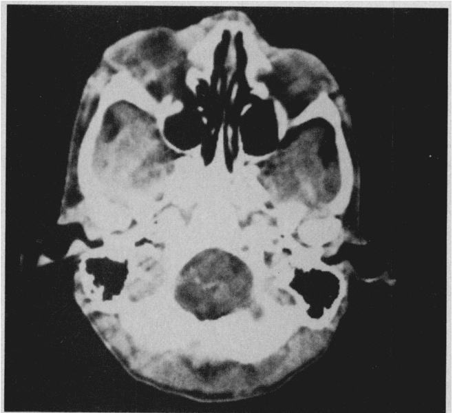
Fig 1.—Scan showing engorgement of intracerebral and ophthalmic veins. No cerebral infarct is noticeable.

Examination showed a 15 × 7-cm, pulsatile mass in the right side