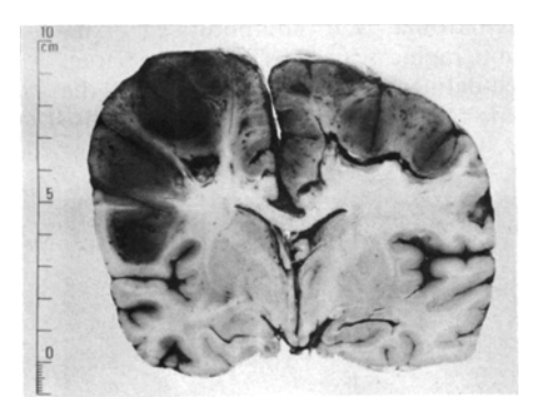
FIGURE 1: Coronal section of the brain at the level of the mamillary bodies. Extensive haemorrhagic necrosis is present in the parietal lobes. (The cleft is artefactual.)

A complete necropsy was performed. No toxaemic lesions were found either macroscopically or microscopically. The superior sagittal sinus was completely