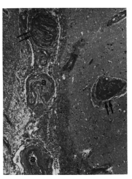
FIGURE 3: Meningeal vessels. The arteries (a) are patent while the veins (arrows) are filled with fresh thrombi. (Haematoxylin and eosin stain; magnification × 102.)

Sections of the parietal cortex (Figure 2) confirmed extensive and recent necrosis. The meningeal veins (Figure 3) contained fresh thrombi. The arteries were normal. All the other organs were histologically normal, although most renal glomeruli showed mesangial thickening.