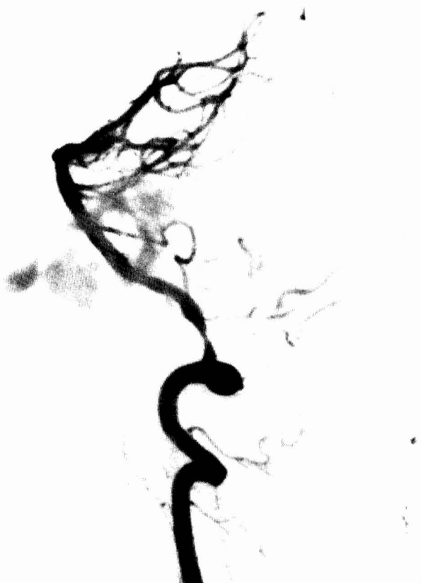
FIG. 2. Case 2. Lateral projection of the preoperative left vertebral angiogram (subtracted) demonstrates both focal stenosis and poststenotic dilatation.

parallel course with the medulla (Fig. 1). Surgically, the accessibility of the vertebral artery as it runs along the medulla can be determined from the angiogram by measuring the distance of the vertebral artery from the midline and allowing for one-half the width of medulla at this point. In three autopsy cases in which the operation was performed and in these two surgical cases, the vertebral artery was accessible to the level of the rostral part of the olive and was limited by the retractability of the rootlets of the 9th and 10th cranial nerves, which cross the vertebral artery posteriorly. In one of our autopsy cases the entire hypoglossal nerve also crossed posterior to the vertebral artery, and in our first surgical case a few rootlets crossed posterior. This anatomical variant could present technical problems at operation.