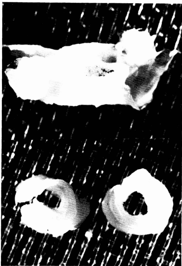
FIG. 3. The atherosclerotic plaque that was removed from Patient 2. The distal end of the plaque is on the right in both views. The actual length of the plaque is 1 cm.

In Case 2, the plaque was quite localized and poststenotic dilatation was evident. The plaque was calcified, its yellow