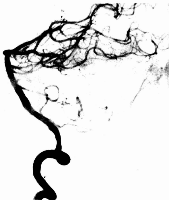
FIG. 4. Case 2. Lateral projection of the postoperative left vertebral angiogram (subtracted) taken 3 months after operation.