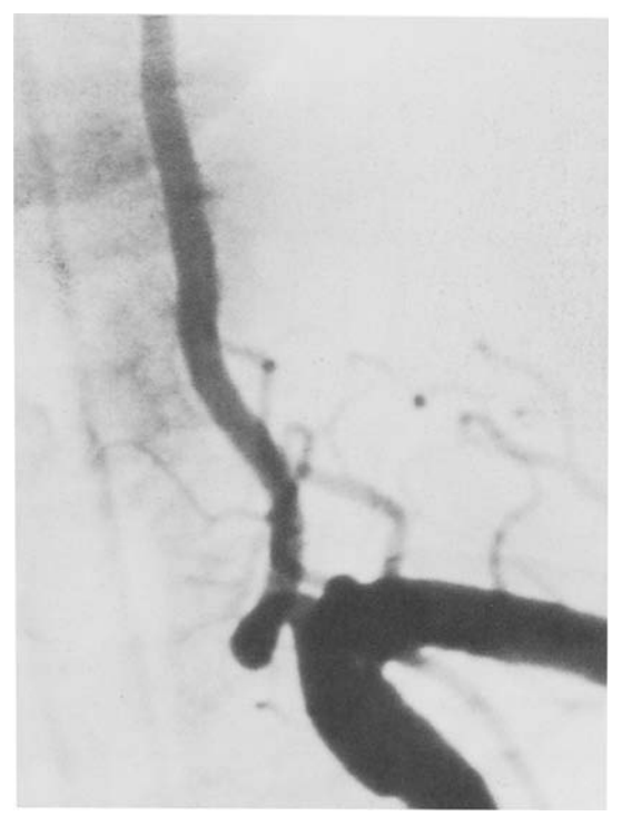
Fig. 5: Elongation and tortuosity of the first part of the left vertebral artery.

after the angiogram. The actual indication for operation was the preoperative occlusion of the contralateral vertebral artery. We feel quite definitely that a direct reconstructive operation is prefereble to a vertebral bypass, although in certain cases this might also provide a solution. Since the first successful endarterectomy of the vertebral artery in 1959 by DeBakey et al. (4) and by Cate and Scott (2), the