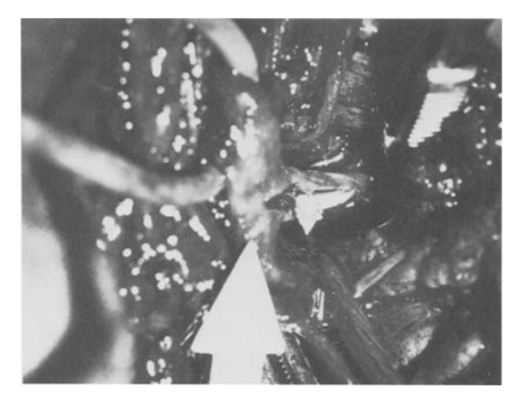
Fig. 3: Disobliterated stenosis at the origin of the left vertebral artery.

after the angiogram. The actual indication for operation was the preoperative occlusion of the contralateral vertebral artery. We feel quite definitely that a direct reconstructive operation is prefereble to a vertebral bypass, although in certain cases this might also provide a solution. Since the first successful endarterectomy of the vertebral artery in 1959 by DeBakey et al. (4) and by Cate and Scott (2), the