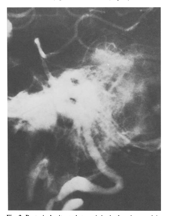
Fig. 2: Posteriorly situated stenosis in the fourth part of the vertebral (after Rieben).

successfully reconstructed. Four interventions involved elongation and tortuosity of the vertebral artery with kinking and stenoses. In three explorations the situation was found to be inoperable: one stenosis at the origin, one occlusion and one elongation of the vertebral artery. In this connexion the inoperability was accentuated by an elongation so that the constricted right vertebral artery arose from the posterior wall of the subclavian artery and the vertebral origin was displaced still further dorsally by an elongation of the subclavian artery. Such anatomical variations of the origin of the vertebral artery should always be borne in mind, particularly when interpreting the angiograms. One should pay attention to more posteriorly placed stenoses (Fig. 2).