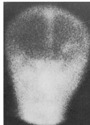
Fig. 1. Radionuclide brain scan (Tc99m), shows increased uptake in left frontotemporal region consistent with cerebral infarction.

A left common carotid arteriogram was obtained 10 days after the onset of symptoms. The common carotid artery proximal to the bifurcation was normal. An irregular plaque extended from the bifurcation into the internal carotid artery (Fig. 2). Stenosis was also seen in the external carotid artery. Minimal stenosis was noted in the intracranial portion of the internal carotid artery in the pre-cavernous and cavernous segments. The intracranial circulation was otherwise unremarkable. The patient tolerated the procedure well and there was no change in neurological status during or following arteriography. The patient was discharged and readmitted 12 weeks later for repeat arteriography and