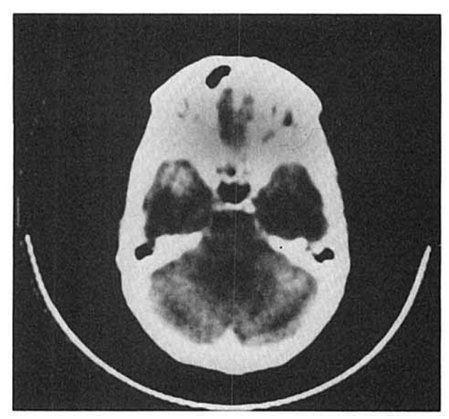
Fig 1. (Patient 1) Contrast-enhanced CT scan shows a roundish abnormal area in the anterior part of the left temporal lobe.