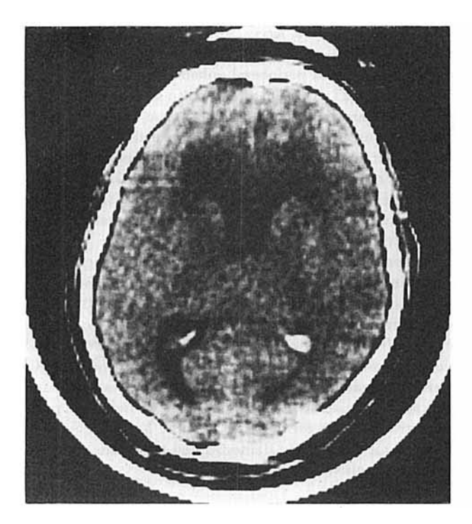
Fig 3. (Patient 3) Nonenhanced CT scan shows areas of periventricular hypodensity surrounding both frontal horns. These areas did not enhance after injection of contrast medium.