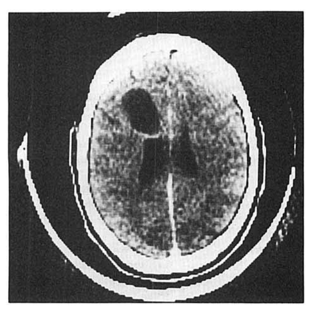
Fig 2. (Patient 2) An area of low density surrounded by a calcified posteromedial rim is seen in the left frontal lobe impinging in the anterior left lateral ventricle (enhanced study).

Six months before that, a severe head injury had resulted in fracture of the left orbit and frontal bone and several days of unconsciousness. Over the ensuing 4 years he had a few similar attacks while taking diphenylhydantoin and phenobarbital. At the age of 30 he suffered a generalized tonic-clonic seizure. At 34, focal motor seizures of the right upper extremity started and his wife noticed progressive "mental dullness" and "inattentiveness." Five years later, radionuclide brain scan and bilateral carotid and vertebral angiograms showed no abnormality. CT scanning, how-