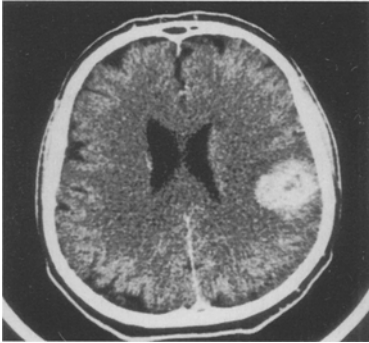
Figure 1. Cerebral CT scan: right temporal-parietal tumor (high-grade astrocytoma), with irregular contrast enhancement.

a transient motor disphasia. A cerebral CT scan showed a growth of residual tumor, with posterior and deep extension; the left hemisphere appeared undamaged. A further radio- and chemotherapy cycle was performed and seizures were controlled with drugs.