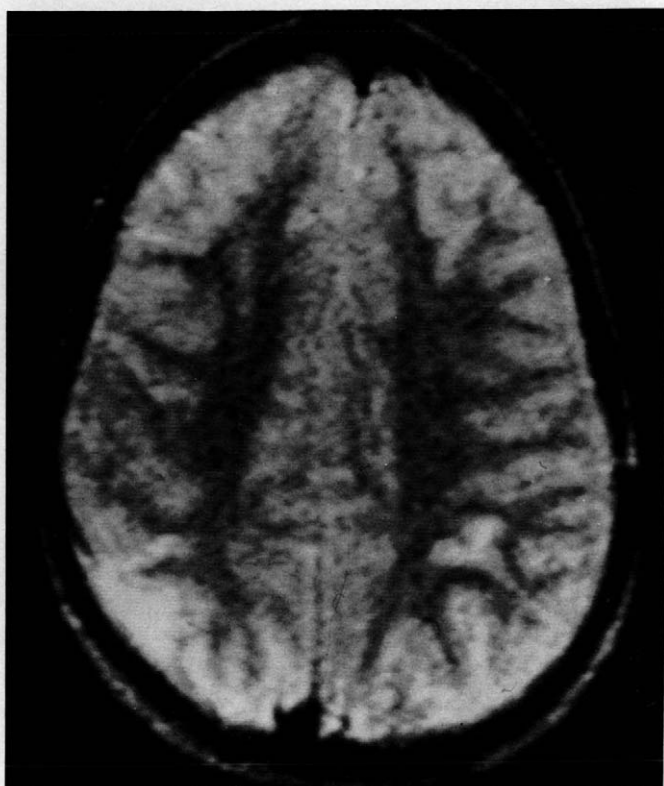
Figure 3. MRI showing a fresh ischemic infarct in white matter of left parietal lobe and an old infarct in the right posterior temporoparietal lobe. This MRI was obtained after the revascularization procedure.

McLean et al 24 reported a case of moyamoya disease in which intravenous verapamil, a calcium channel blocker, was thought to be effective during acute deterioration.