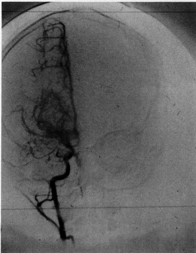
Figure 1. Right carotid angiogram of patient 2 (anteroposterior projection) showing narrowing of the internal carotid artery and prominent moyamoya vessels.

Moyamoya disease, especially when symptoms arise before age 5 years, is very often a progressive disease that ends either in death or severe permanent neurologic deficits. The ultimate course of the disease depends on the rapidity of the occlusive process and the patient's ability to develop adequate collaterals. 22,23 Since the original description of moyamoya disease by Shimzu and Takeuchi, studies on moyamoya disease have failed to satisfactorily elucidate the pathogenesis. Effective treatment is still not available. Surgical revascularization procedures are occasionally of benefit, but many of these patients continue to deteriorate neurologically. Pharmacotherapeutic agents, such as aspirin, steroids, and vasodilators have been tried in the past without success.