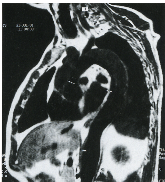
FIG 2. Magnetic resonance imaging of the aortic arch and cervical arteries showing a dissection with false channel (arrows).

Cerebral infarcts are due to common carotid occlusion or artery-to-artery embolism from a thrombus