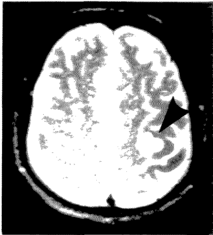
FIG 1. T 2 -weighted magnetic resonance image shows discrete cortical infarct in left frontal area (arrowhead).

mg three times a day relieved the tremor markedly, although mild WT was still observed (Fig 2). However, he complained of somnolence and took medication irregularly. The WT persisted, although slightly diminished in severity, at 7 months of follow-up.