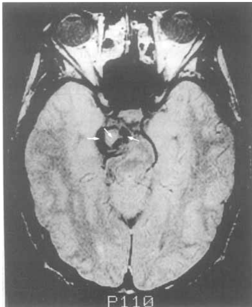
FIG. 1. Proton density image of partially thrombosed giant aneurysm of right cerebral posterior artery showing heterogeneous signal intensity. Central high signal intensity presumably represents methemoglobin, and the low signal intensity peripheral ring is consistent with hemosiderin deposition, except in the medial aspect of the aneurysm, where a lower intensity signal represents the patent lumen signal void (arrows).

mal. Routine laboratory tests were negative. Videotelemetered interictal scalp/zygomatic EEG recording showed bursts of theta activity mixed with sharp discharges over the right mesiobasotemporal region, and during the usual seizure the EEG showed rhythmic 4–6-HZ sharp wave activity initially recorded on the right zygomatic electrode. Computed tomography showed a small calcification in the ambiens cistern on the right side. Magnetic resonance imaging (Figs. 1 and 2) disclosed a spherical mass measuring 2.5 cm in diameter at the ambiens cistern, which compressed the right cerebral peduncle and the right hippocampal formation. Axial spin-echo T2-weighted MRI showed a partially thrombosed aneurysm with central high signal intensity, which presumably represented methemoglobin and a peripheral ring of low signal intensity consistent with hemosiderin deposition. A lower intensity signal on the medial aspect consistent with a patent lumen signal void was also observed. Cerebral angiography showed a partially thrombosed saccular aneurysm at the origin of the right posterior cerebral artery (Fig. 3). Selective amygdalohippocampotomy and occlusion of the posterior cerebral artery proximal to the aneurysm were performed. Pathologic findings included severe neuronal loss, gliosis, and abundant macrophages with hemosider-