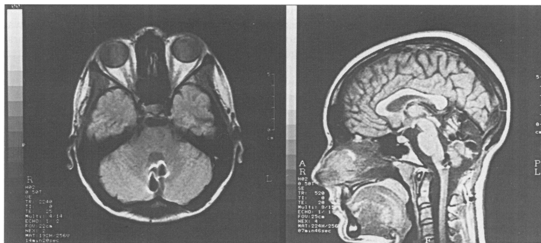
Figure 1 MRI of patient 1 after surgery of a cerebellar a-v malformation. Coronal (left) and sagittal (right) plane. The lesion extends over the midline and destroys the vermis (lobules III to VIII) and both fastigial nuclei. On the right some clip artefacts projections on to the medulla can be seen.

Histopathology verified the diagnosis of a haemangioblastoma (Lindau tumour).