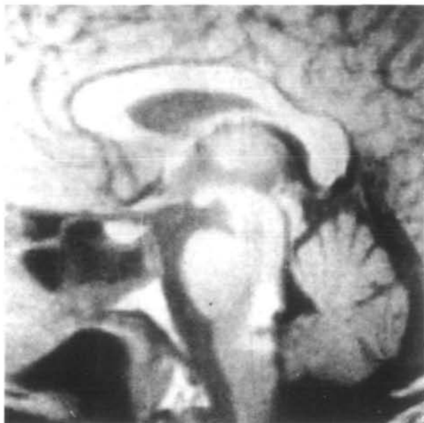
FIG 1. Sagittal T 1 -weighted (repetition time, 520 milliseconds; echo time, 21 milliseconds) magnetic resonance imaging scan showing a dorsal medullary hemorrhage with pontine extension.

ache and vertigo with nausea, vomiting, and a "tingling" sensation in all four limbs. In the following hours he developed dysphagia, dysarthria, and horizontal diplopia. On admission his blood pressure was 130/80 mm Hg. Neurological examination showed a normal level of consciousness, vertical (upward and downward) and bilateral horizontal gaze-evoked nystagmus predominating on left gaze, signs of bilateral palatal weakness and areflexia, and right hypoglossal palsy, right hemiparesis predominating in the leg, decreased sensation to pain and temperature in the right limbs, and bilateral dysmetria and dysidiadochokinesia.