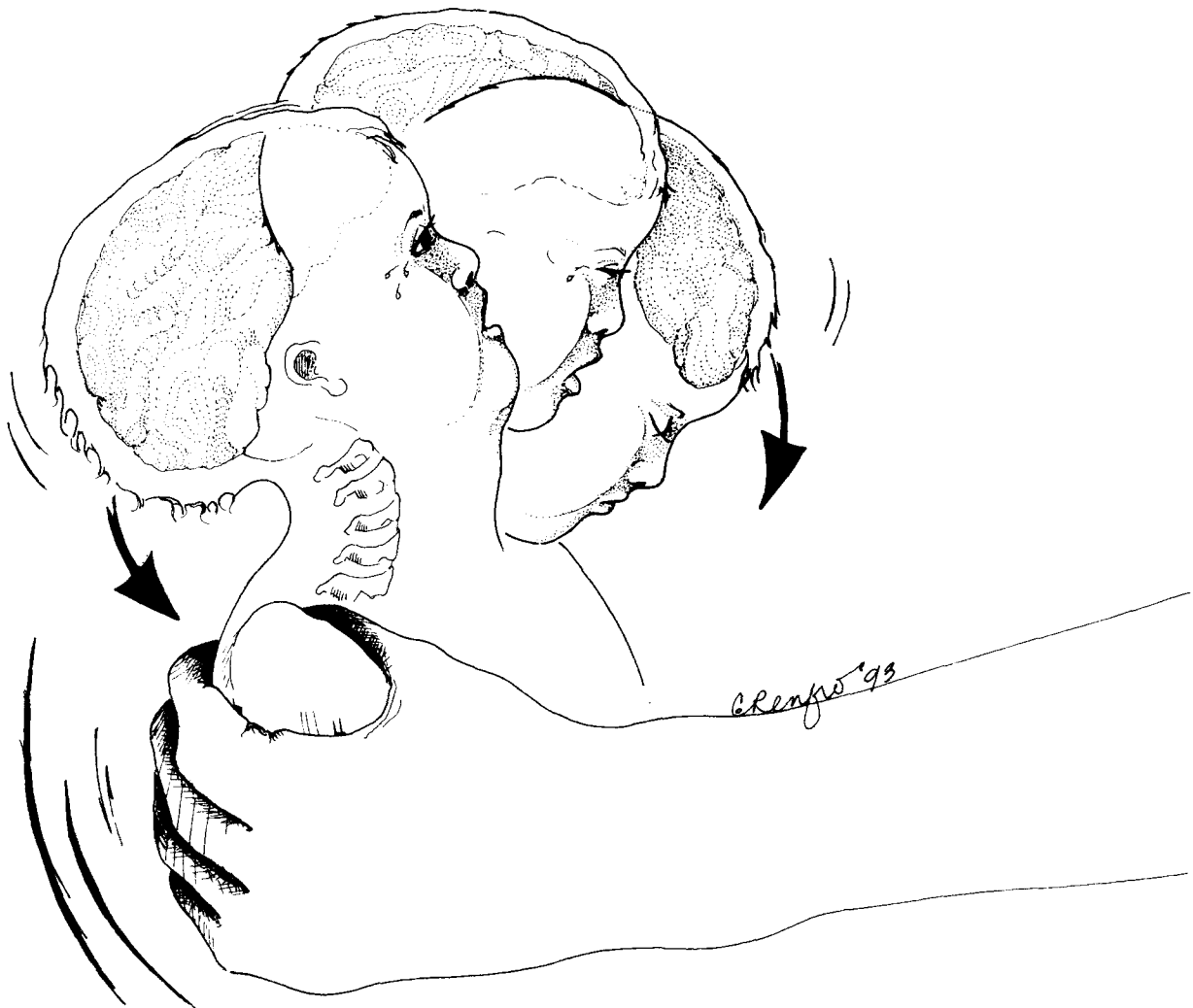
■ FIGURE 1 Vigorous shaking produces acceleration-deceleration of the infant's head and results in the whiplash injury.

noted on the right, but no extraocular movements were detected on the left. Funduscopy examination showed massive retinal hemorrhages bilaterally. Dark red ecchymotic areas were found on both upper arms, and yellowish-green ecchymoses were noted on her abdomen and posterior thighs. The remainder of the physical examination was normal.