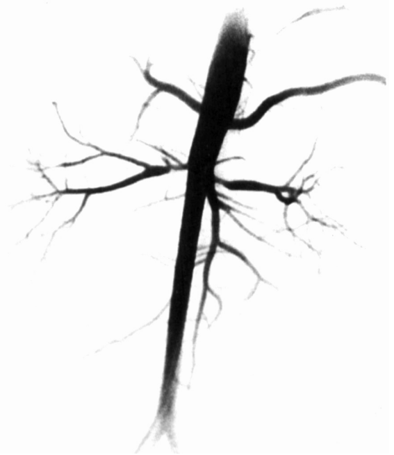
Fig. 3 Abdominal aortography (frontal view). Proximal segmental stenosis of bilateral renal arteries.

performed and plasma renin activity measured: right renal vein, 6.1 ng/mL/h; left renal vein, 2.6 ng/mL/h; upper inferior vena cava, 3.1 ng/mL/h; lower inferior vena cava, 2.8 ng/mL/h.