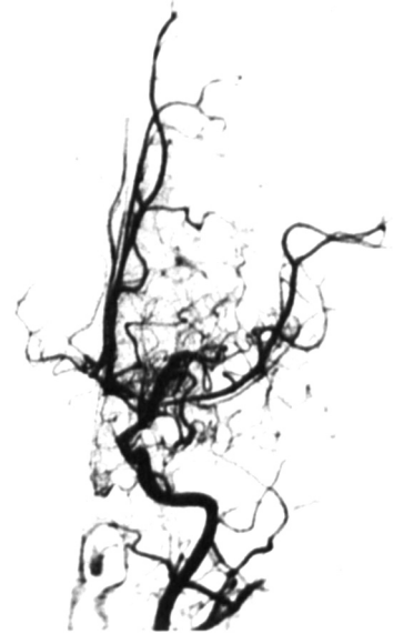
Fig. 2 Left carotid arteriography (frontal view). Intracranial stenosis and 'moyamoya' networks.

Head aortography (Figs 1, 2) showed severe stenosis at the terminals of both internal carotid arteries. Bilateral anterior and middle cerebral arteries were nearly obstructed. The unusual vascular networks typical of moyamoya disease were observed, and distal portions of arteries were stained later through these collateral 'moyamoya' networks. There were also severe stenosis and 'moyamoya' networks around the area of the posterior communicating artery and posterior cerebral artery. Abdominal aortography (Fig. 3) demonstrated proximal segmental stenosis of both renal arteries. There was no evidence of aortitis or arteriosclerosis. Selective blood sampling from veins was