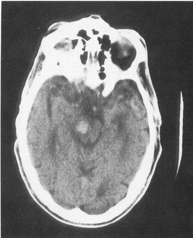
Figure 2. Case 2. Unenhanced CT scan, showing 1.25-cm hyperdense zone representing hemorrhage in right cerebral peduncle.

found to have an enlarged brain stem. She was treated with a shunt and irradiation at that time. CT and MRI scans obtained during her current episode showed multiple angiographically occult vascular malformations with a 3-cm hemorrhage in the central midbrain. A cerebral angiogram was negative. She slowly and incompletely improved.