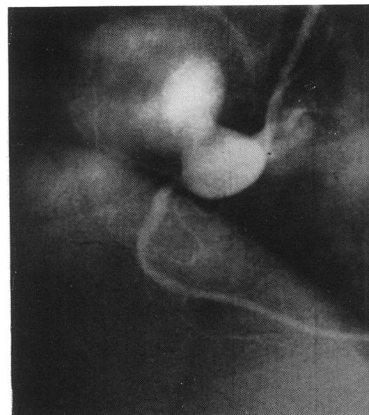
Figure 2 Right coronary sinus angiogram showing a large aneurysm of right sinus of Valsalva with eggshell-like calcification and a normal dominant right coronary artery.