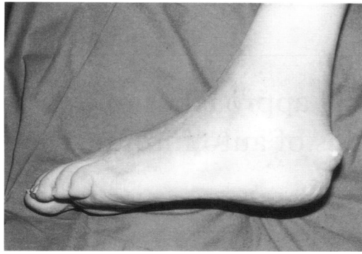
Figure 2 The left heel of the patient following aspiration, showing white tophaceous material that had travelled up the needle track.

mechanical effect of the large tophus was impeding mobilisation it was excised nine weeks after his stroke. His subsequent recovery was uneventful.