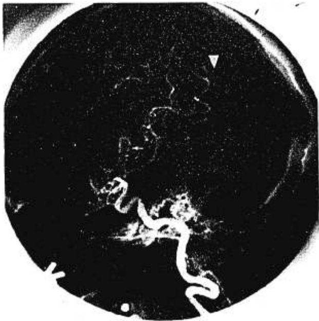
FIGURE 2. Cerebral arteriogram shows total occlusion of the temporal occipital artery (arrowhead) and thrombus in transitional branch of middle cerebral artery (arrow).

titer, nonreactive rapid plasma reagin, and normal protein C and S activity. Antithrombin III activity was normal. Dilute thromboplastin time was 1.2 seconds (normal). Anticardiolipin antibody IgG and IgM levels were 4.1 GPL (normal, 0 to 23) and 4.3 MPL (normal, 0 to 11), respectively. RVVT time was 1.8 seconds (normal, 0.8 to 1.2 seconds). In view of the medical history, angiographic findings, and abnormal RVVT result, a diagnosis of antiphospholipid syndrome was made. In spite of a small episode of acute cerebral bleeding, anticoagulation with warfarin sodium (Coumadin) was initiated to prevent further thrombosis. Anticonvulsants were gradually discontinued, and no further seizure activity has occurred.